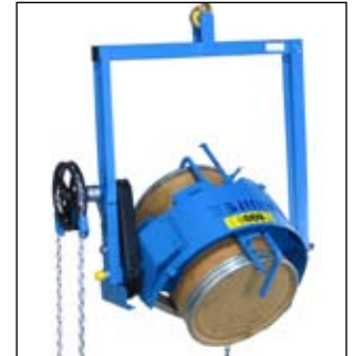
Kontrol-Karrier with Model 55/30-16

Insert the correct size Diameter Adaptor to handle your smaller drum. Diameter Adaptors are available for sizes from 14" to 22" diameter. They are available to fit below-hook Kontrol-Karriers, as shown here, Forklift-Karriers, Hydra-Lift Karriers, and Vertical-Lift Drum Pourers.