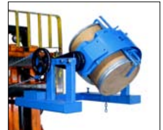
Forklift-Karrier with 55/30-16