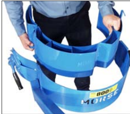
Insert into Drum Holder

Diameter Adaptors are easily inserted into drum holder in just a few seconds. With the hooks slightly above the drum holder, advance it into the drum holder and tilt the Diameter Adaptor downward so that as the hooks engage the top of the drum holder band, it settles into place with its lower tabs protruding below the band. Your drum handler is now ready to handle the smaller drum size.