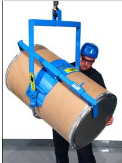
Model 85i with Bracket Assembly Option (part # 4556-P) installed