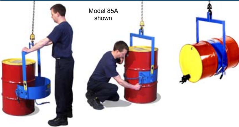
Model 85A shown

The suspended Drum-Karrier is pushed against the drum so that the drum holder is positioned to engage between the drum ribs.