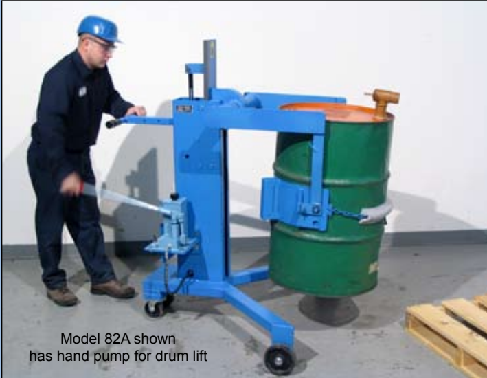
Model 82A shown has hand pump for drum lift