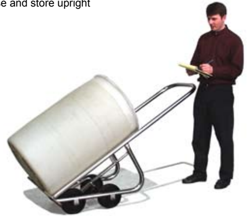
Model 160-SS made of type 304 stainless steel