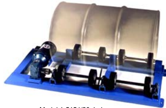
Model 1-5154/20-1 shown rolls a drum at 20 RPM