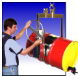
Model 185A-HDSS Kontrol-Karrier shown with Hand Wheel Option