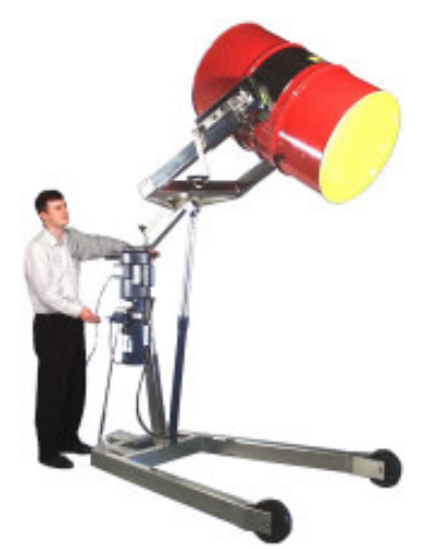
Custom Stainless Steel version of Hydra-Lift Drum Karrier Model 400A-60-120

Custom Stainless Steel version of Vertical-Lift Drum Pourer Model 510-115