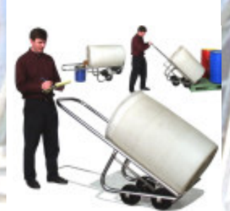
Model 160-SS 4-Wheel Drum Truck