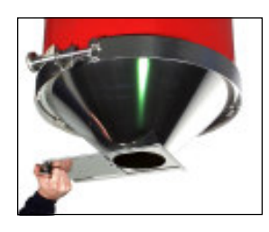
Model 5SS-SG-45-23 Stainless Steel Drum Cone