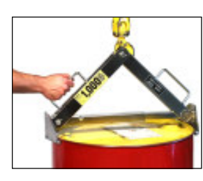
Model 92-SS Below Hook Drum Lifter

Stainless steel alloys, with their chromium content, have higher resistance to oxidation (rusting) and corrosion because the chromium forms a surface layer impervious to water and air. When the surface is scratched the layer quickly reforms... a phenomenon called passivation. This layer protects the metal beneath and retains the shiny appearance of your stainless steel drum handler.