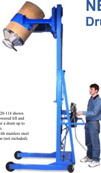
Model 520-114 shown has air powered lift and tilt to pour a drum up to 106" high. Shown with stainless steel drum cone (not included).

Now you can lift, tilt and drain drum contents with ease. A hydraulic lift and tilt system makes it simple to raise and tilt heavy drums. Vertical lifting track keeps drum reach constant through the full lift range. Dispense into a vat, hopper, mixer or other container up to 106" high. Manual lift and tilt also available. With Scale-Equipped Series, you know the weight of what you have poured! The digital indicator keeps you informed of the drum weight. You will be able to weigh even while pouring.