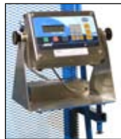
"T" Type Intrinsically safe scale indicator for use in hazardous areas.