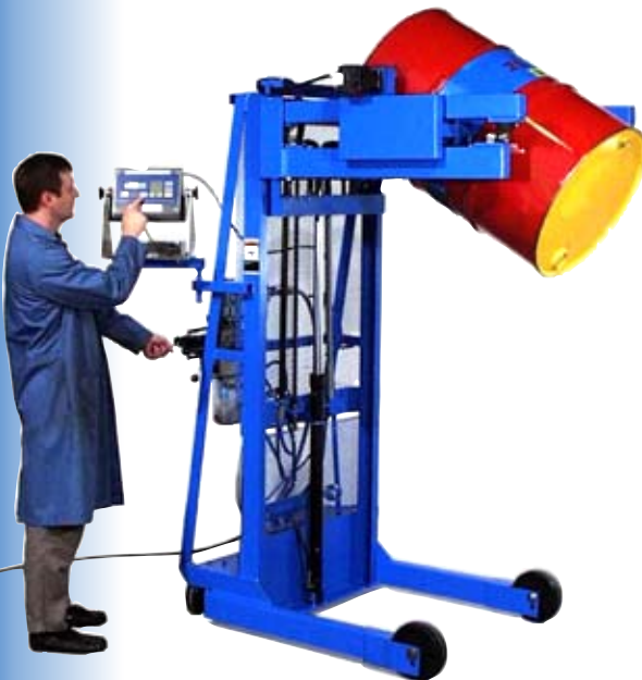
Model 515-T-114 shown is equipped with an intrinsically safe scale and air powered lift and tilt.

Vertical-Lift Drum Pourers are available with optional spark resistant monel parts, such as drum holder bands.