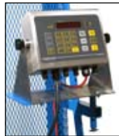
"N" Type scale indicator NOT for hazardous environments.